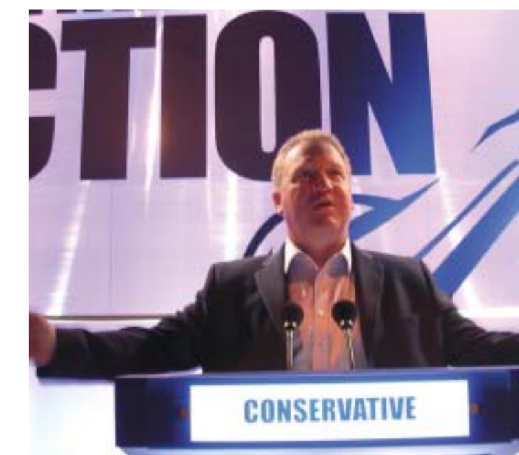
Mike Penning wants action not words

The Labour MP said when he was elected in 2001, "I've safeguarded our hospitals future." Well, the future is grim; a few weeks ago the Labour Minister signed the hospital's death warrant. Hemel residents deserve a hospital that has services based on the clinical needs of the local community. Hemel Hospital was built for the needs of local residents, now Labour are destroying it.